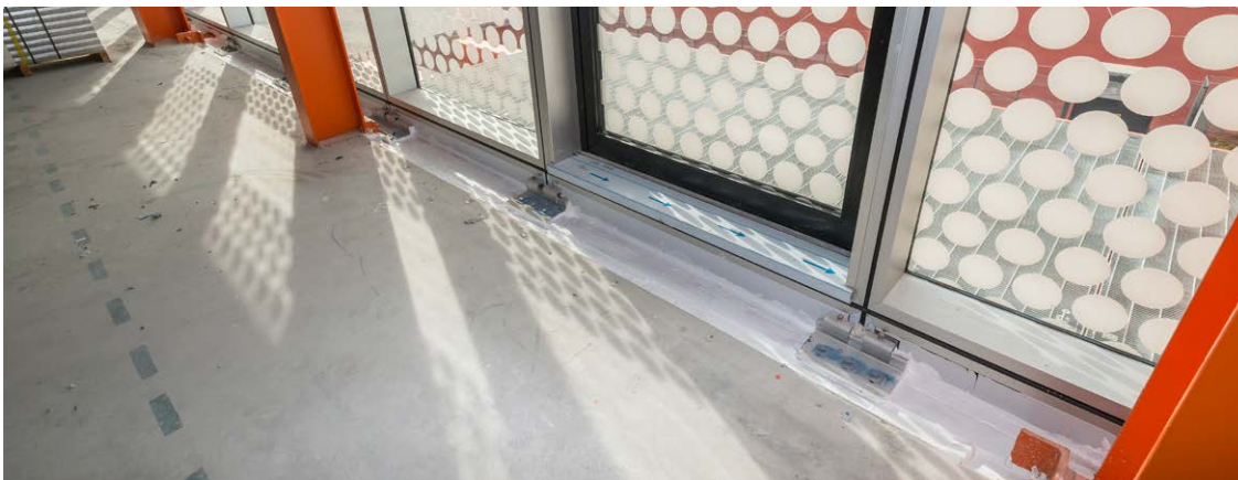
SoftSeal installed as a linear joint seal

*Linear Joints over 300mm wide can be accommodated, with the addition of steel Z brackets. For further information and advice on sizes or applications, please contact Rockwool Technical Solutions Team on 01656 862621.